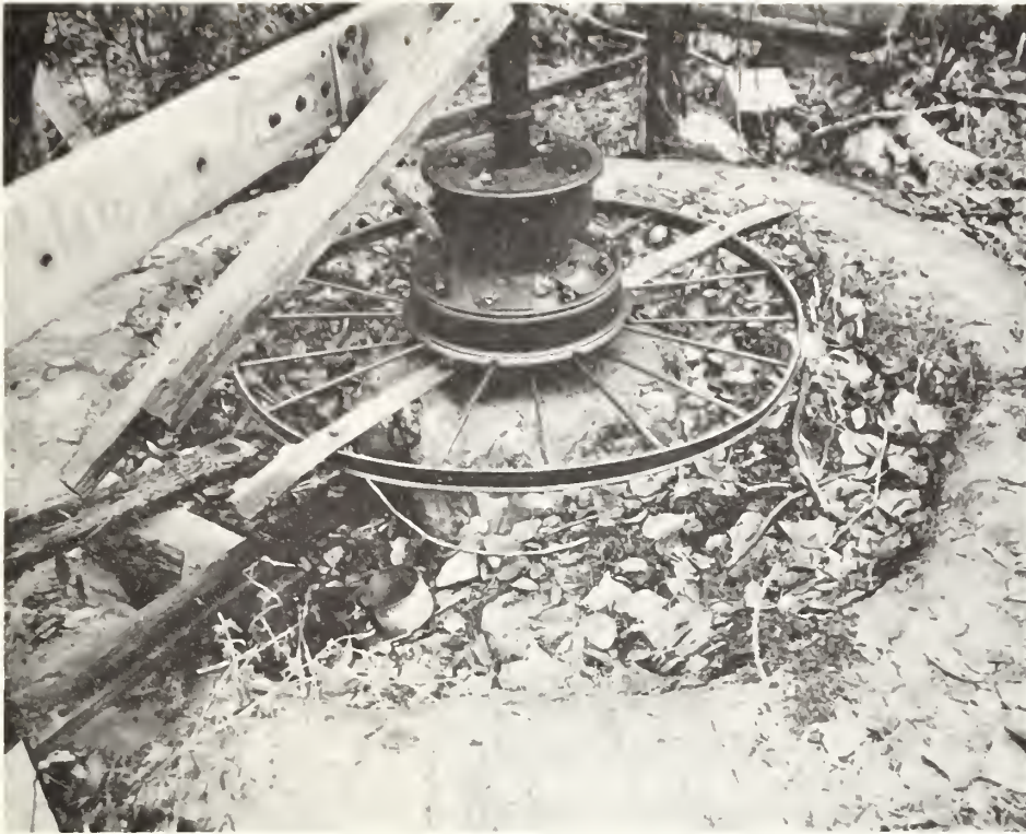
Figure 5. A portion of the Bobbit Mine arrastra on Palmer Creek.